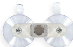
Suction cup fastening