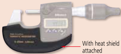
With heat shield attached