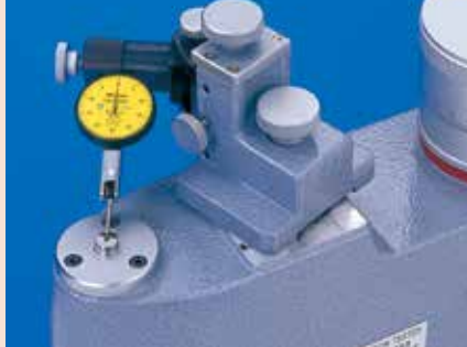
Calibrating a dial test indicator