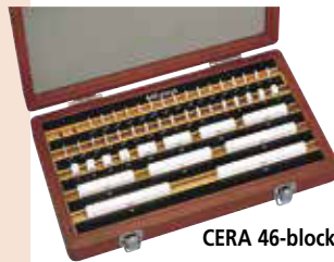
CERA 46-block set