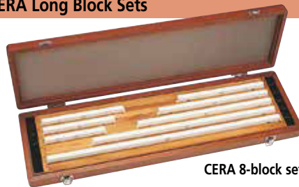
CERA 8-block set