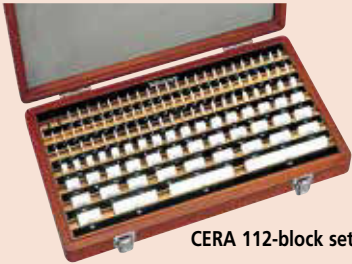
CERA 112-block set