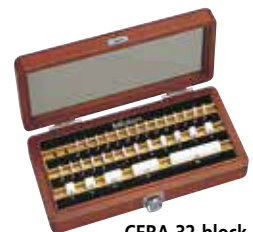
CERA 32-block set