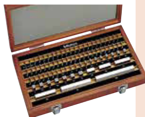
Steel 76-block set