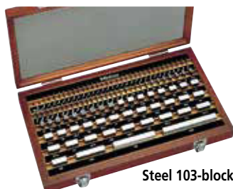
Steel 103-block set