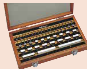
Steel 56-block set