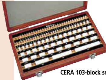
CERA 103-block set