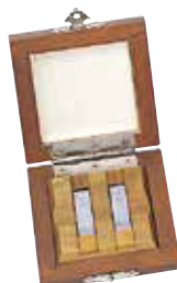
Steel (1 mm)