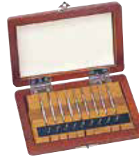
CERA 9-block set (0.991 - 0.999 mm)