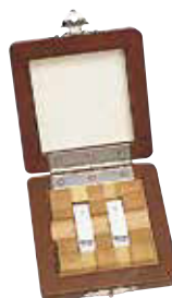
CERA (1 mm)

Note: Details of the contents of any particular set are given on page E-10.