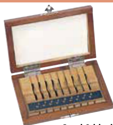
Steel 9-block set

Note: Details of the contents of any particular set are given on page E-9.