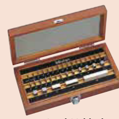
Steel 32-block set