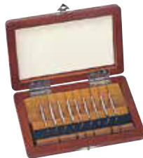
CERA 9-block set (1.001 - 1.009 mm)