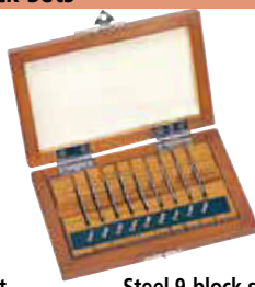
Steel 9-block set (0.991 - 0.999 mm)