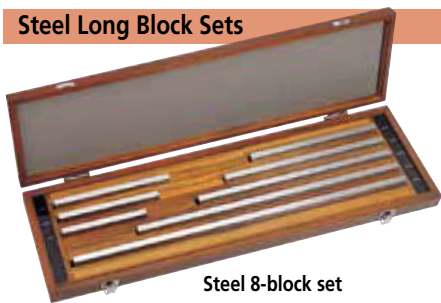
Steel 8-block set