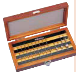
Steel 34-block set