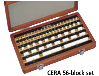
CERA 56-block set