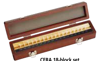
CERA 18-block set