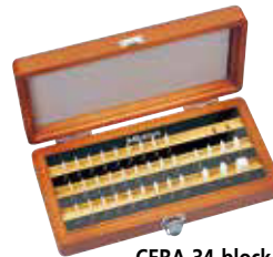
CERA 34-block set