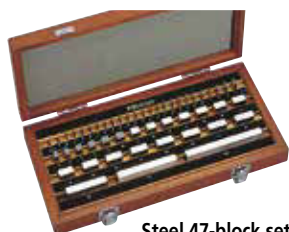
Steel 47-block set