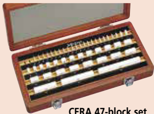
CERA 47-block set