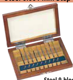
Steel 9-block set (1.001 - 1.009 mm)