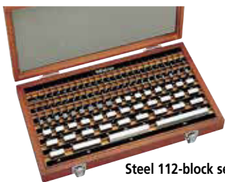
Steel 112-block set