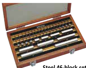
Steel 46-block set