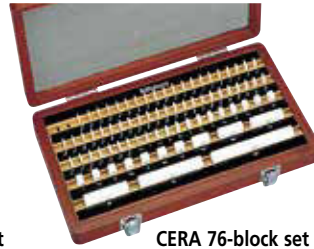
CERA 76-block set