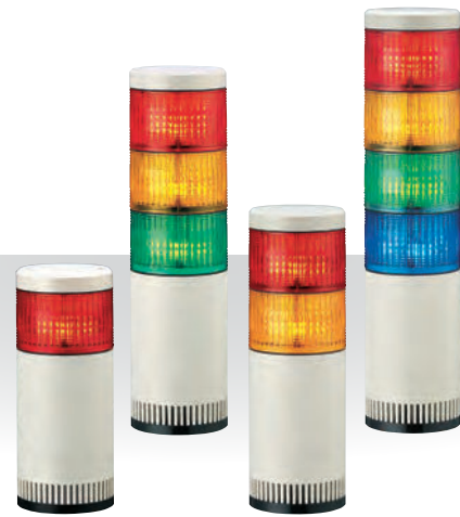
LGE Type: Continuous on LGE-FB Type: Continuous on, flashing/alarm